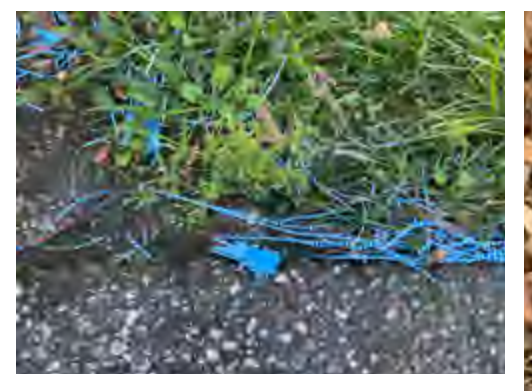
Pick up random pieces of trash. Plastics are most harmful because they break down into micro plastics and travel up the food chain.