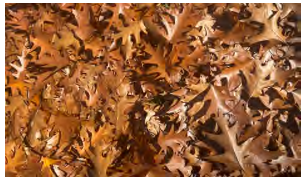
Don't rake leaves. Leaves are home for fireflies and more.