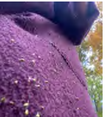
Collect seeds of various invasive plants to keep them from dispersing. Here, I picked Japanese barberry, Porcelain berry, Oriental bittersweet, and Asian jumpseed. Each walk = a gift of time for the land.