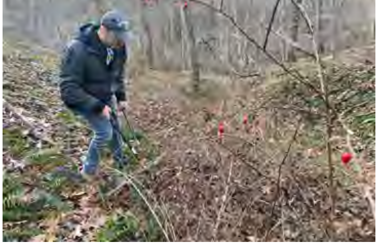
Learn how to identify and remove invasive plants. Window cut is the best technique for vines. Cut at shoulder height and at base all way around tree.