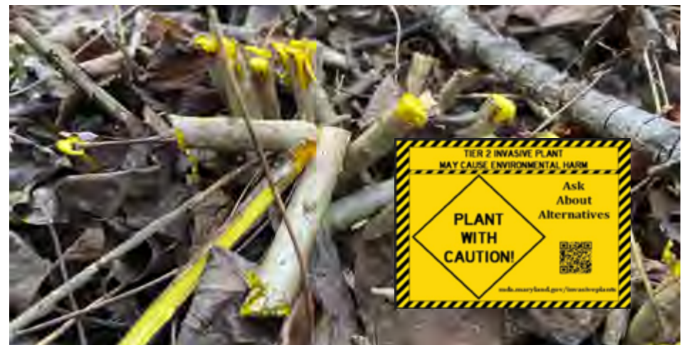
Don't buy invasive plants. Replace your invasive plants with native alternatives. Talk to your neighbors about what you are doing and why.